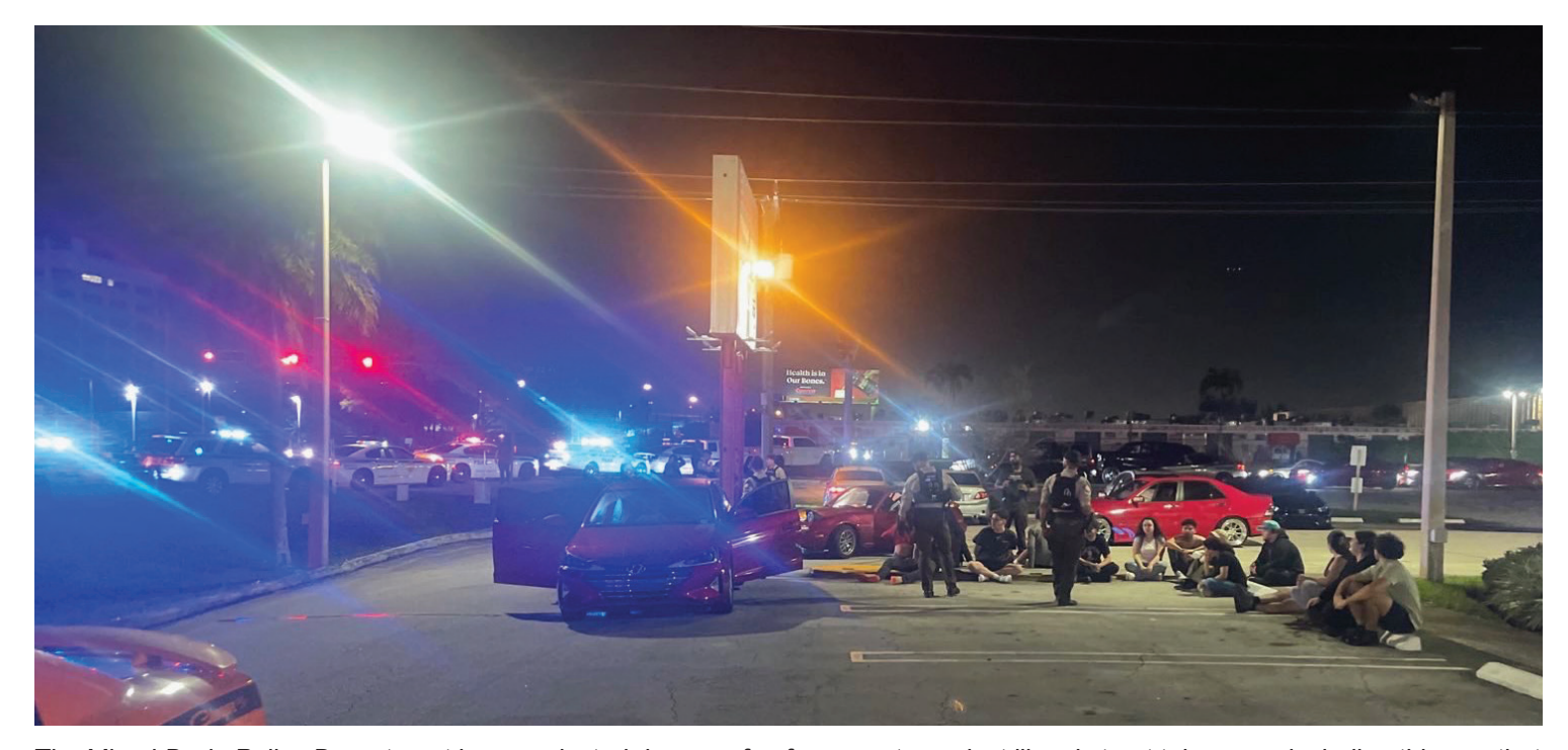
The Miami-Dade Police Department has conducted dozens of enforcements against illegal street takeovers, including this one that was recently broken up as the result of the Department's ongoing investigations and surveillance of those dangerous events.

An urgent solution was needed to address the frenetic pace of intersection takeovers and the dangers associated with them. Fights and shootings often broke out, and spectators were being struck and thrown through the air by out-of-control cars performing reckless stunts. The clamp-down of intersections by teenagers, using their cars as barriers to form an inner stage, prevented first responders from traveling through intersections to respond to 911 calls, posing a critical public safety threat.